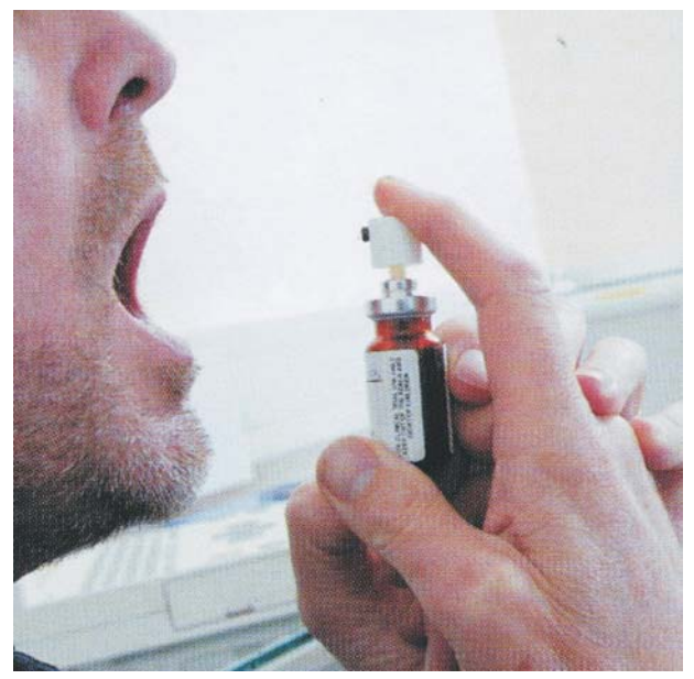
Reprinted with permission from GW Pharmaceuticals.

FIGURE 6. Pump Action Sublingual Spray as utilized in the United Kingdom (photograph courtesy of GW Pharmaceuticals).